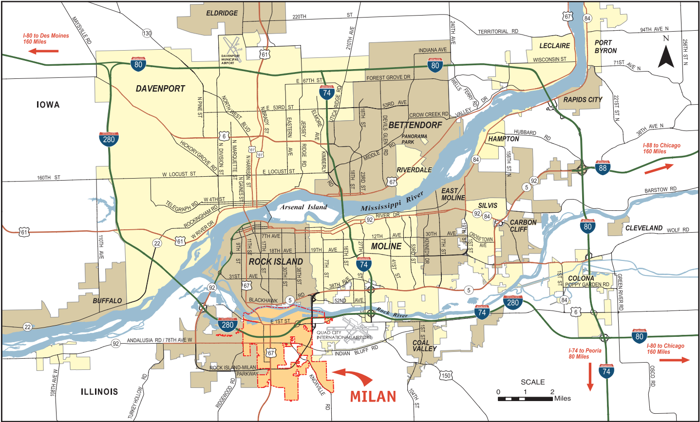
Location of Milan, Illinois in the Quad Cities Metro Area ▼